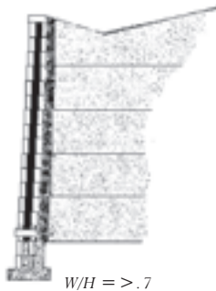
Back Wall Easement