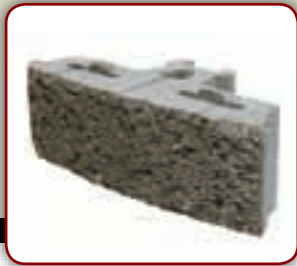
GRAVITYSTONE® EDGE UNITS A & B WITH MODULAR