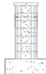
Barriers, Columns & Planters